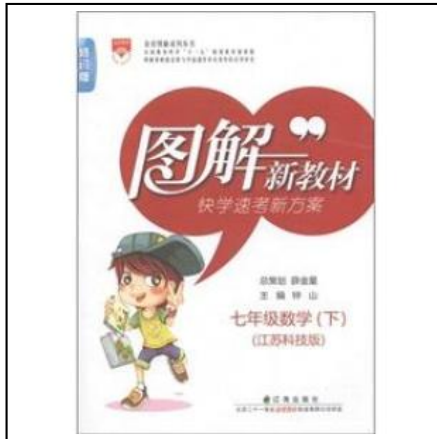
Diagram of the new materials: 7th grade math (Vol.2) (Jiangsu Science and Technology Edition) (Revised) (Chinese Edition)